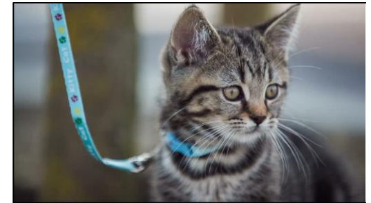
“Pets in the city” Your pet. Your responsibility